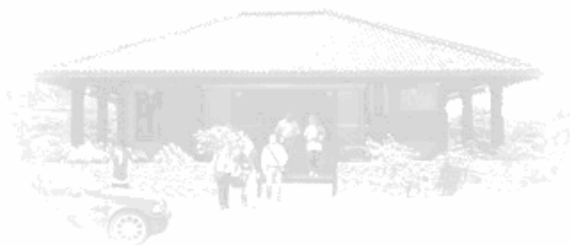
Sarasavi Information & Outreach Centre