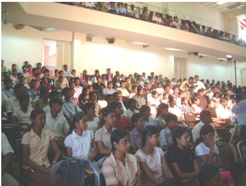
ශිෂ්‍යත්ව ප්‍රධානෝස්සවයට පැමිණි සිසුන්