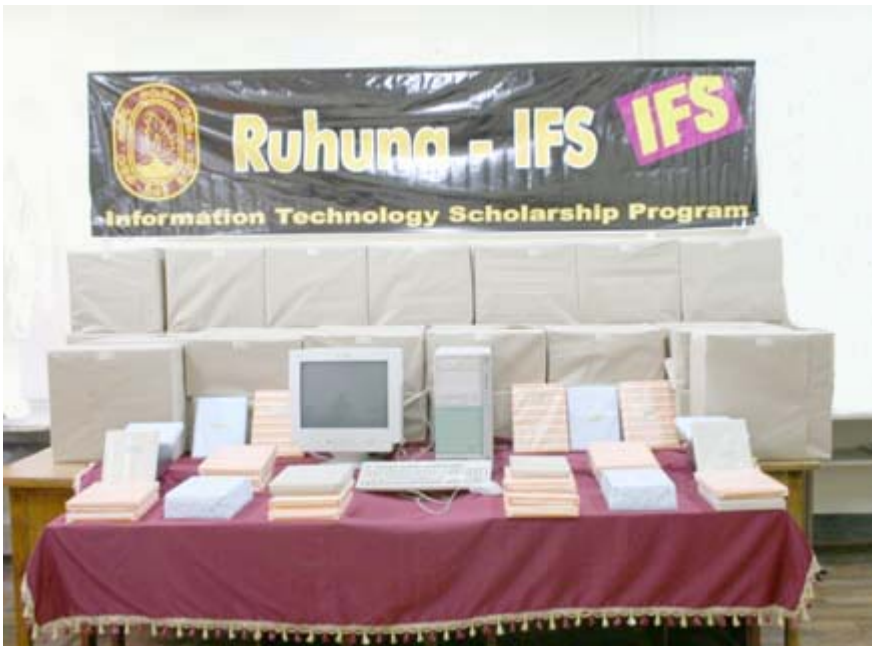
පරිගණක සහ අනෙකුත් කෑගි