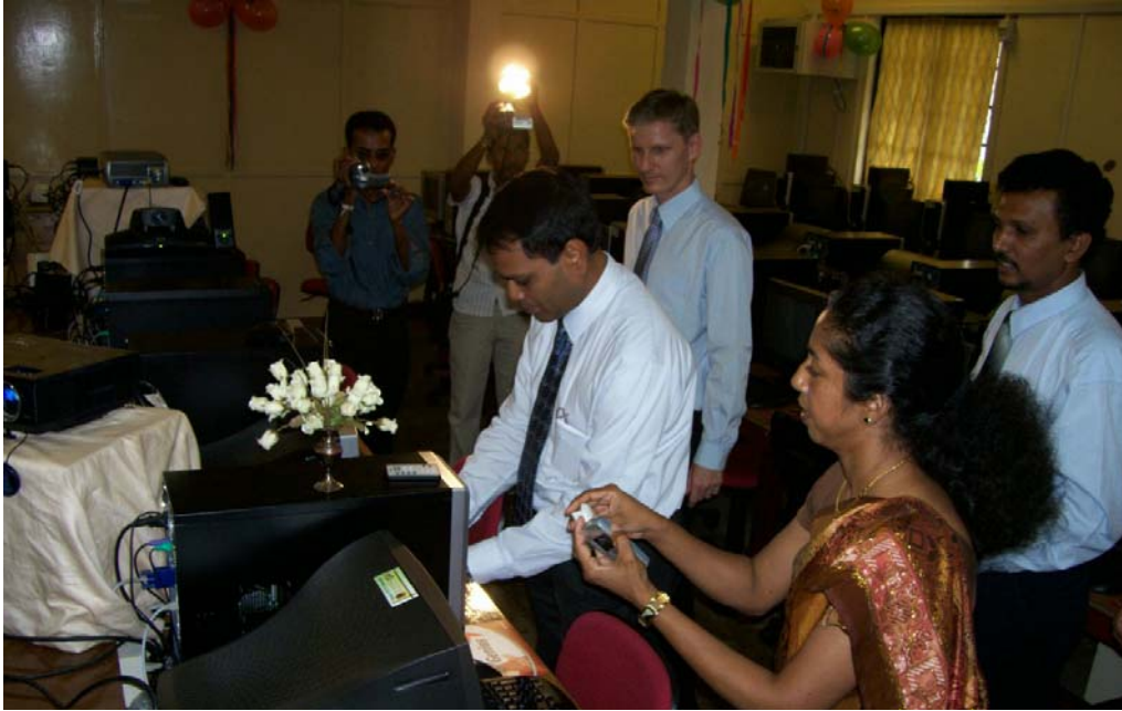
නව පරිගණක වැව්විද්‍යාගාරය විවෘත කරමින්